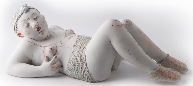
TOP: Cradle. Wilma Cruise. Installation. (As in CSA Magazine No 11, p 21)